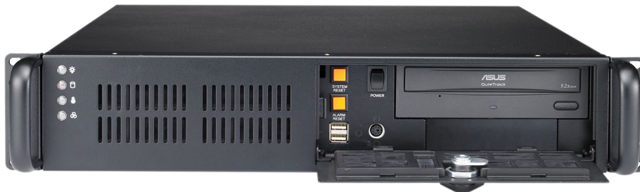
Front view (open)