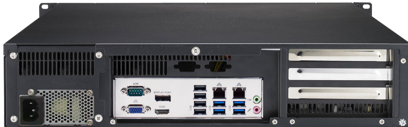
Rear view (version with 3x full-size slots)