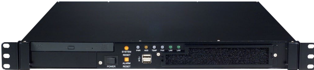
Front view (open)